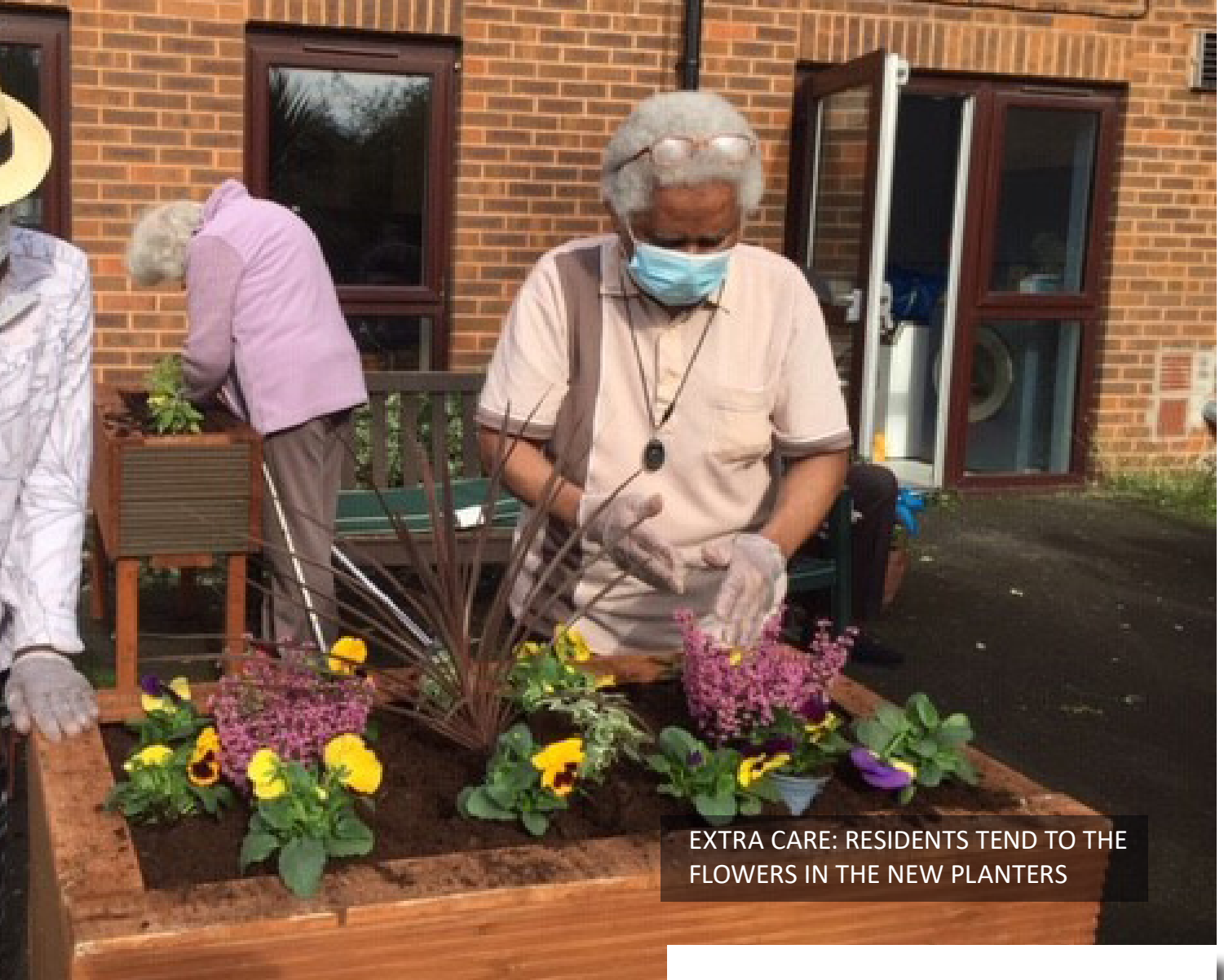
EXTRA CARE: RESIDENTS TEND TO THE FLOWERS IN THE NEW PLANTERS