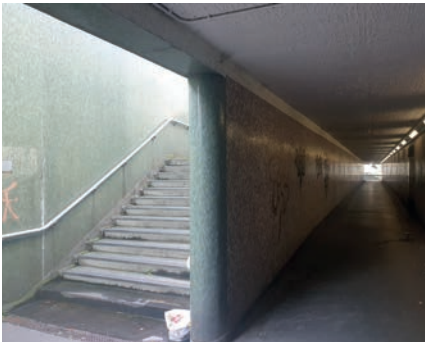
3 Park Lane Gyratory