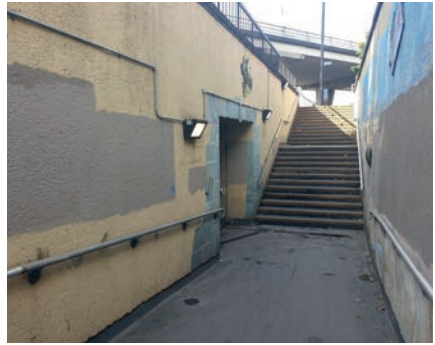
2 Old Town roundabout