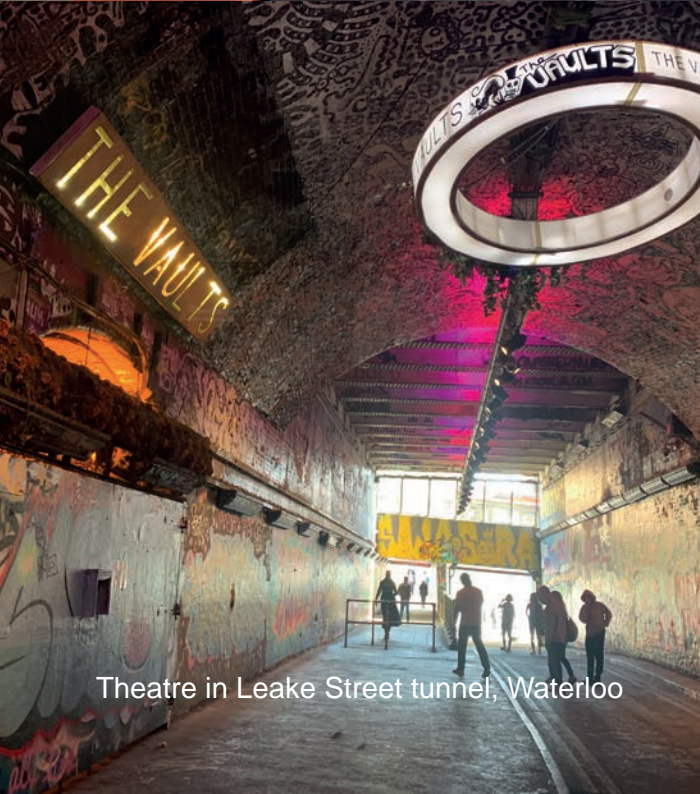
Theatre in Leake Street tunnel, Waterloo