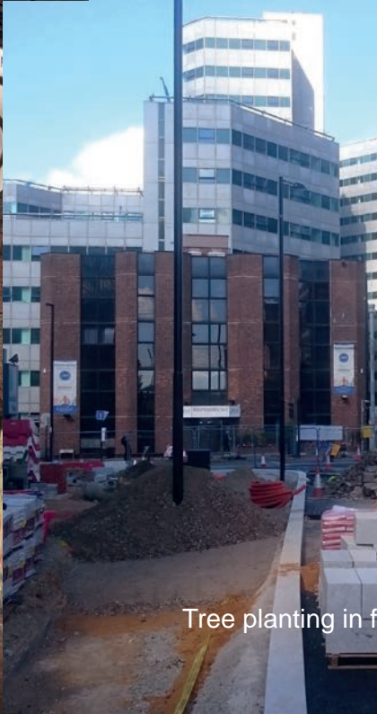
Tree planting in f