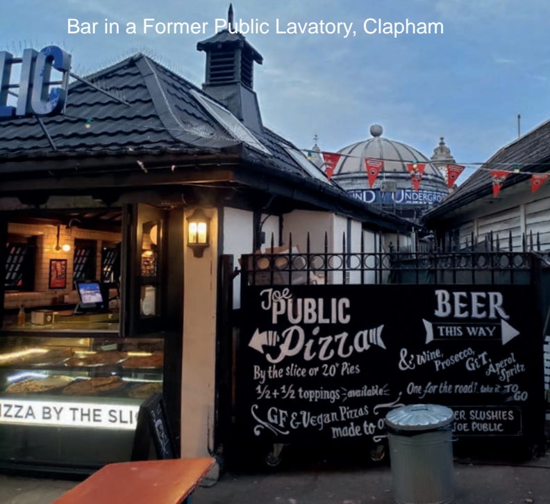
Bar in a Former Public Lavatory, Clapham