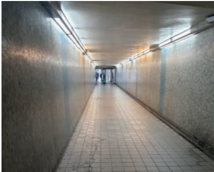
5 Lansdowne Road