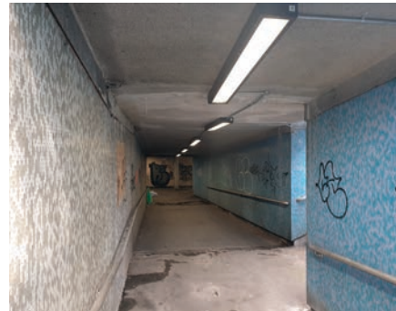
4 Addiscombe Rd